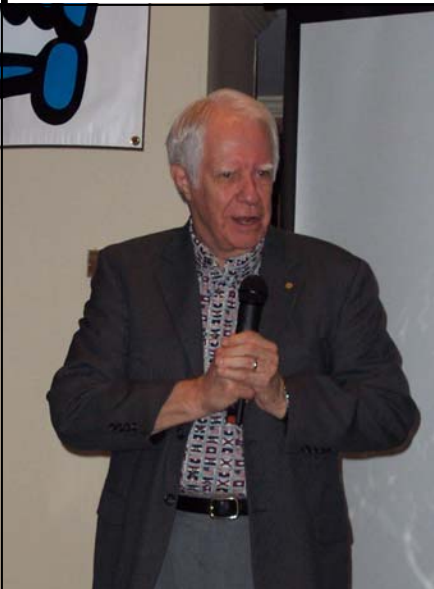
George opened with a brogue.