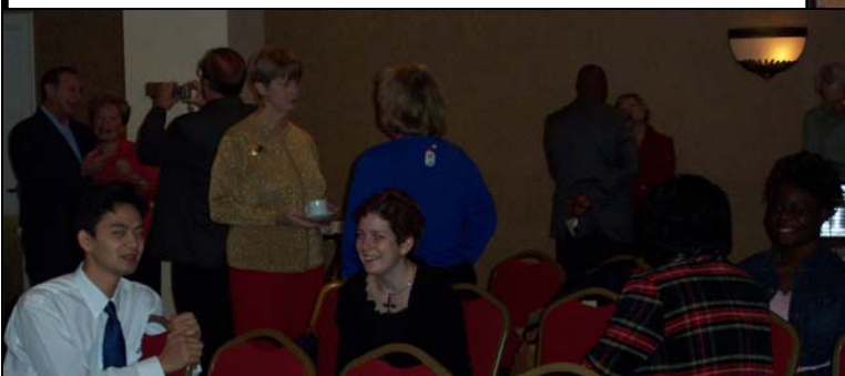
Meeting new friends and old friends