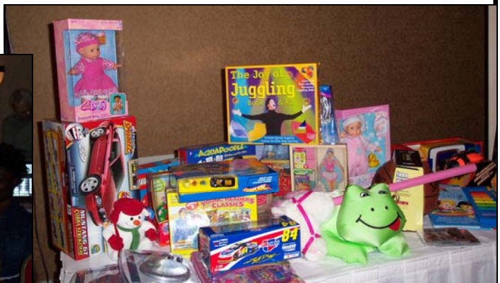
Toy Drive was a big success!