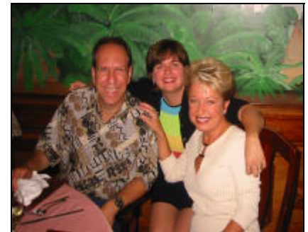
Pictured—just a few of the revelers at the NSA Convention chapter dinner!