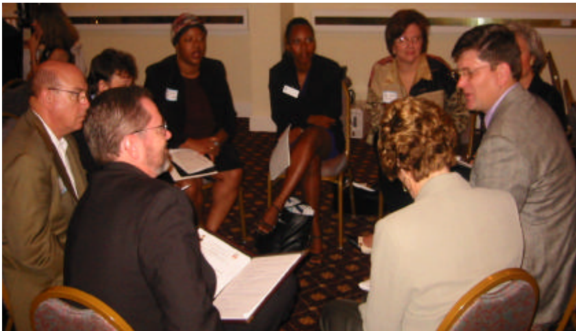
A lively discussion during the PEG best practices session.